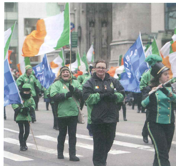
▼ St. Patrick's Day parade

但世上再也沒有其他地方，比愛爾蘭首都都柏林用更震耳欲聾的聲響和熱情迎接這個節慶。全世界最盛大的聖派屈克節慶祝活動是都柏林的聖派屈克慶典，充滿嘉年華式的遊行、壯觀的煙火和戶外舞蹈活動。人們從頭到腳會身著綠色服裝（愛爾蘭的代表色），飲用健力士啤酒（愛爾蘭的著名黑啤酒），並從早到晚歌舞不歇。但是，聖派屈克到底是誰？他又為何對愛爾蘭人如此重要？